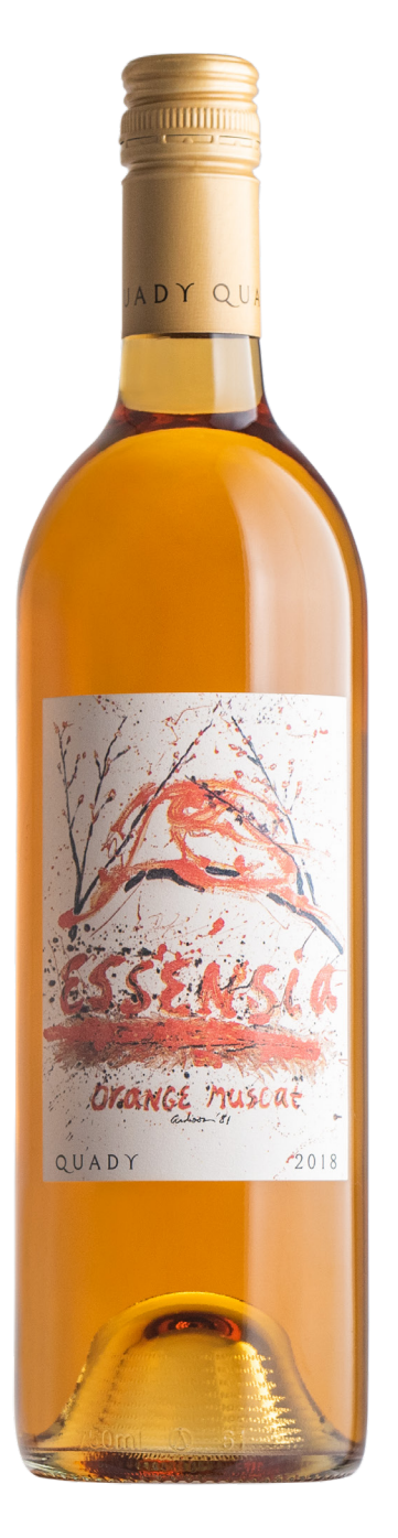
RIGHT: 2018 Vintage of Quady Essensia Orange Muscat dessert wine.